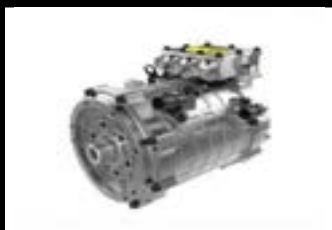
30 kW Peak Power Motor: Quick Acceleration, Powerful Performance