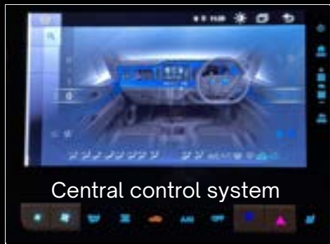
Central control system

Compact and intelligent cockpit design for a more user-friendly experience. Pure electric driving with simple and enjoyable operation.