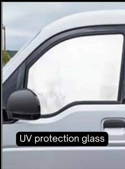
UV protection glass