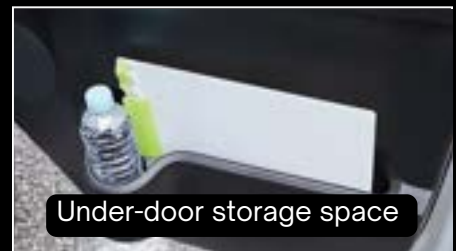
Under-door storage space