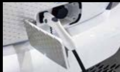
Efficient Fast Charge + Home Slow Charge: Dual charging ports with dual temperature control protection