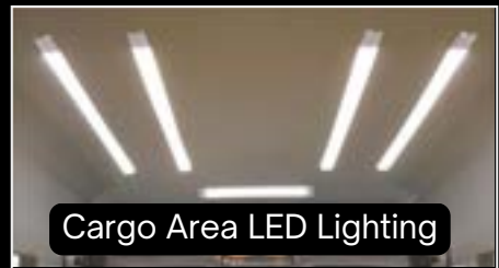
Cargo Area LED Lighting