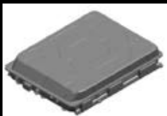
Powered by CATL batteries: delivering high quality, safety, and stability