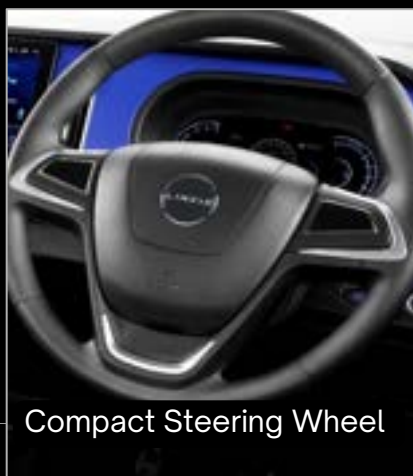
Compact Steering Wheel