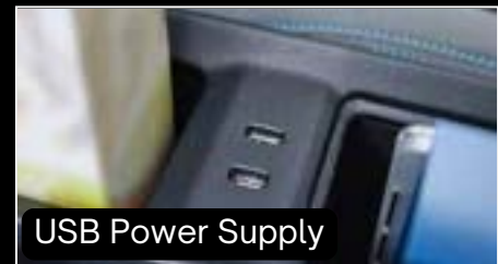
USB Power Supply