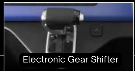
Electronic Gear Shifter